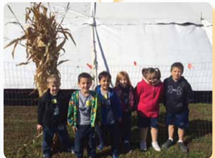
St. Josaphat students took a field trip to the pumpkin patch and petting zoo.